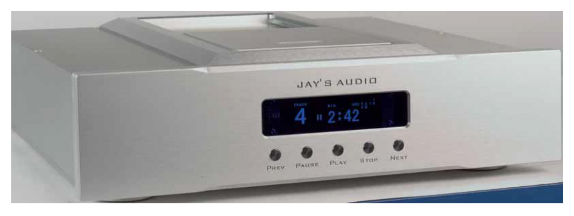
A massive case protects the electronics the CD transport from vibrations