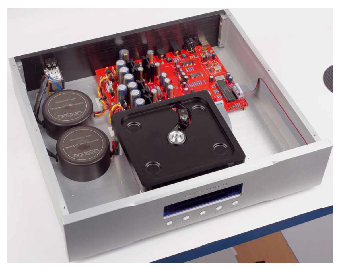
Good power supply and selected Components also distinguish the CDT2