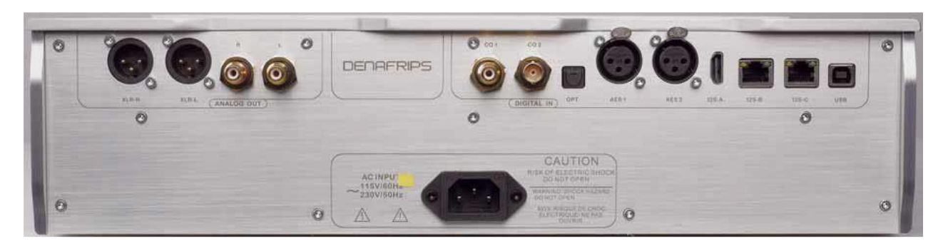
Practically all digital connection types were considered by Denafrips

All connection types, the Jay's audio used on his transport could be received from the Denafrips Terminator. Offers the mighty D/A converter as well a number of other compounds. Coaxial and optical S / PDIF variants and a USB B port is found on the back of the DAC. To come two AES / EBU connections and a total of three entrances, which are I<sup>2</sup>S compatible. Next the transmission via HDMI can the Terminator the signal type also accept by two RJ45 sockets.