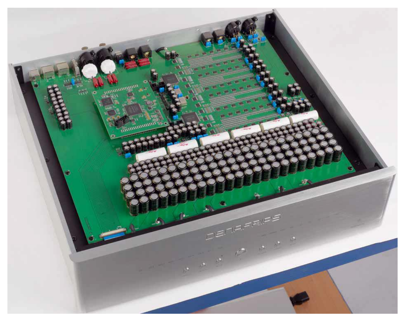
While the electronics occupy the upper area, comes the elaborate power supply in one separate housing under housing