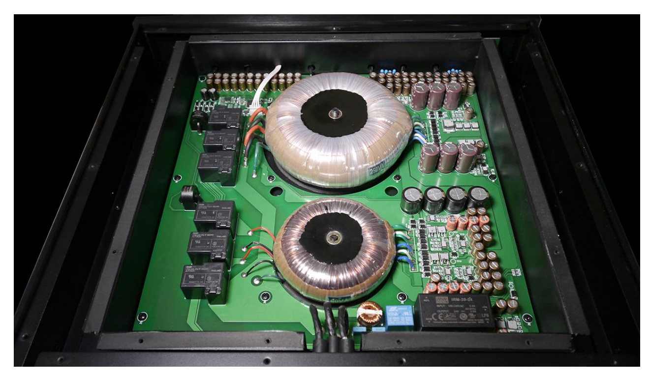
Added for illustration by HEADquarter Audio