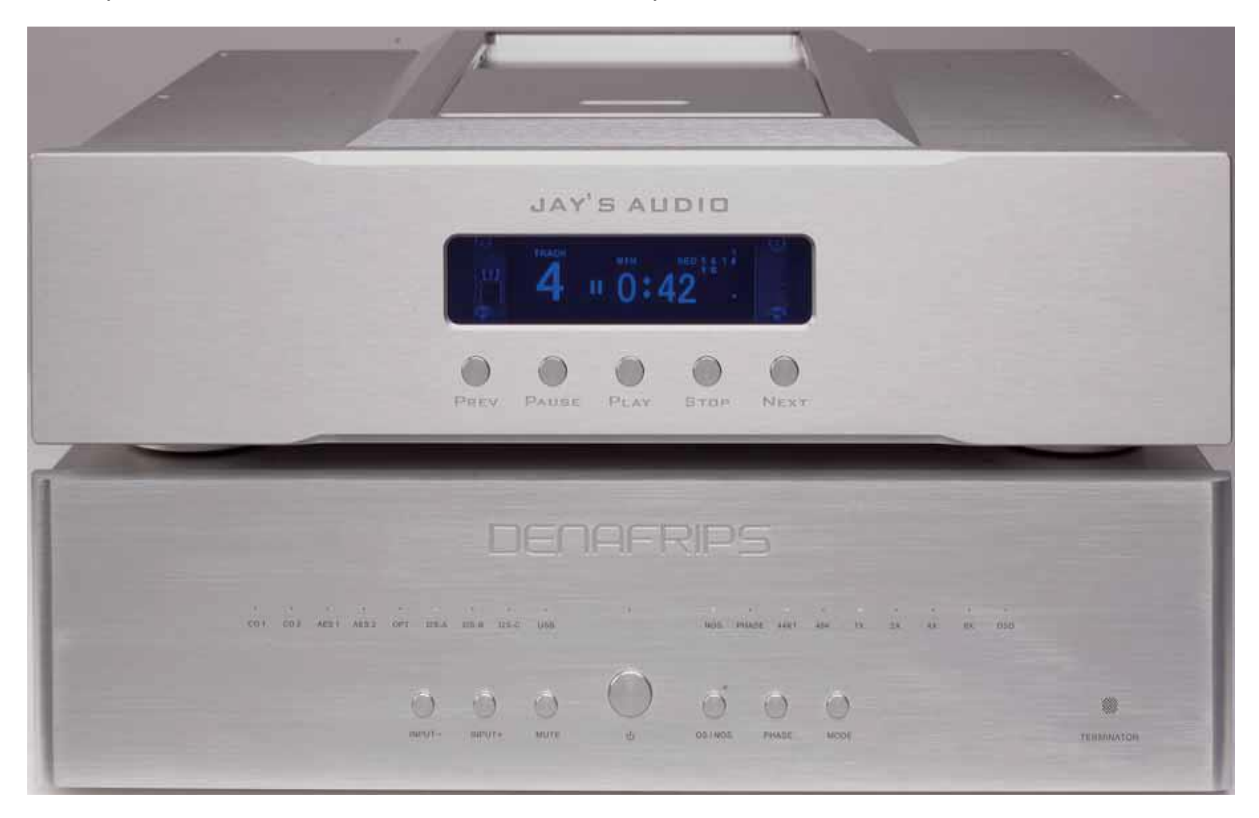
While the large display dominates the look of the CDT2, shows the Terminator with his ads much more restrained

Besides the laser mechanics are natural also the other components of the CD transport with a view to the performance been selected. The Power is filtered so that Noise is suppressed. Quality Components can be found at all Corners and also at the timing the signal processing is precision the top priority. For that usesJay's audio in the CDT2 a clock, the works exactly to the femtosecond.