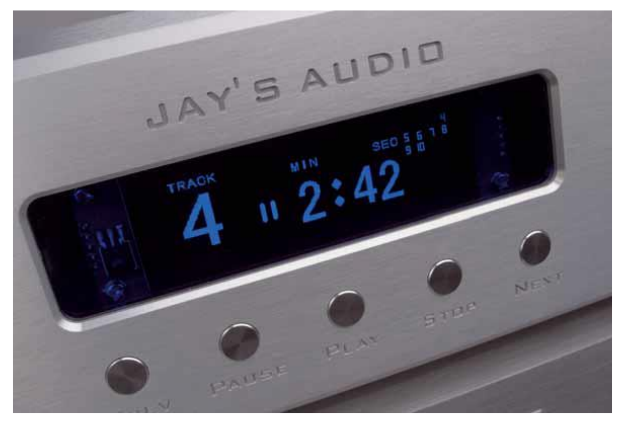
Thanks to large numbers, the display is also easy to read from a distance