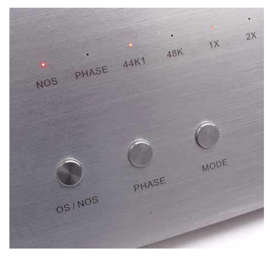
NOS mode, phase and pinout of the RJ45 and HDMI connections can be set via buttons on the front panel

This is determined with the function keys at the front of the converter, as well as the source choice or the Conversion of the I<sup>2</sup>S mode for devices with different pin assignments.